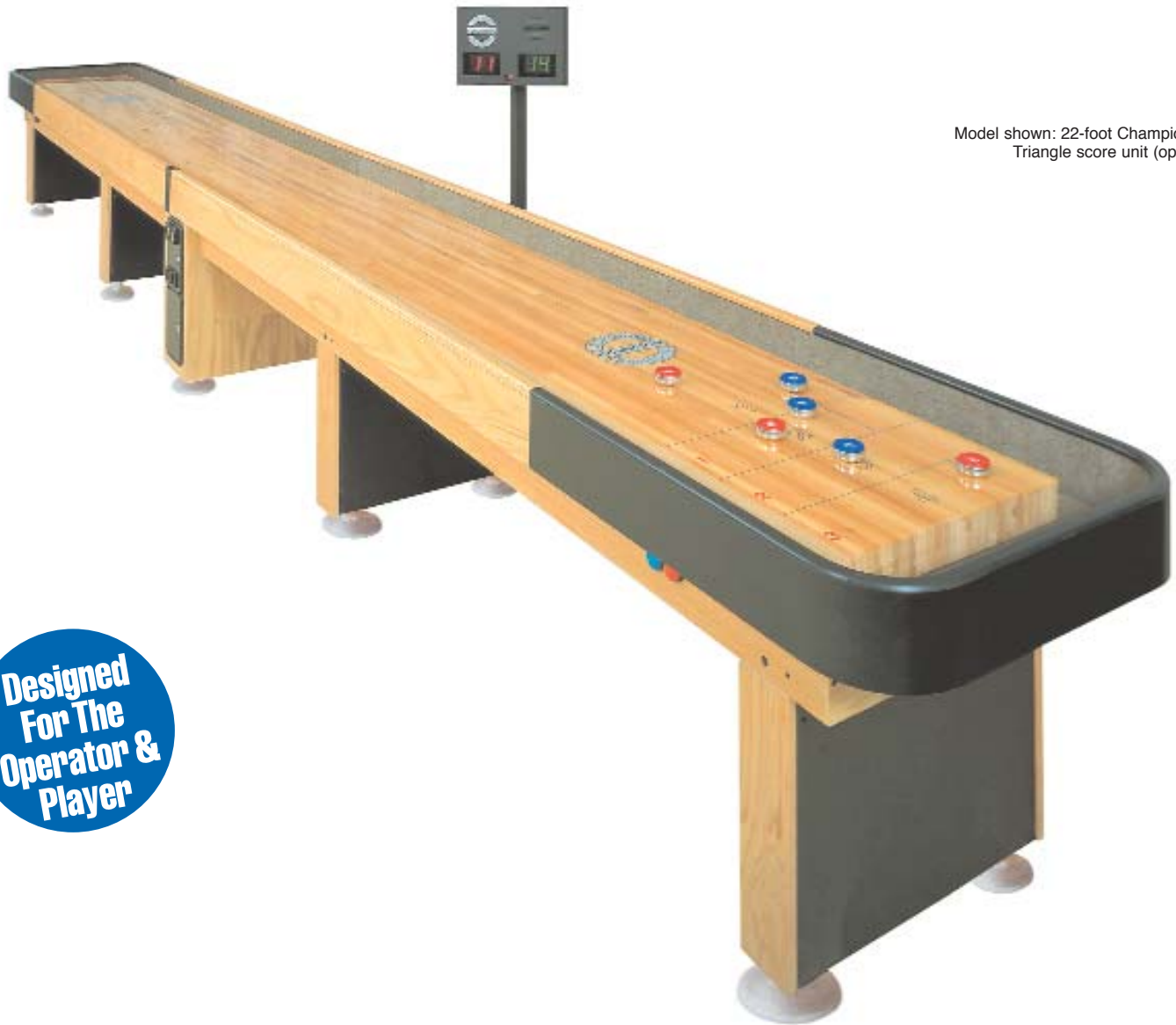
Model shown: 22-foot Champion with Triangle score unit (optional).